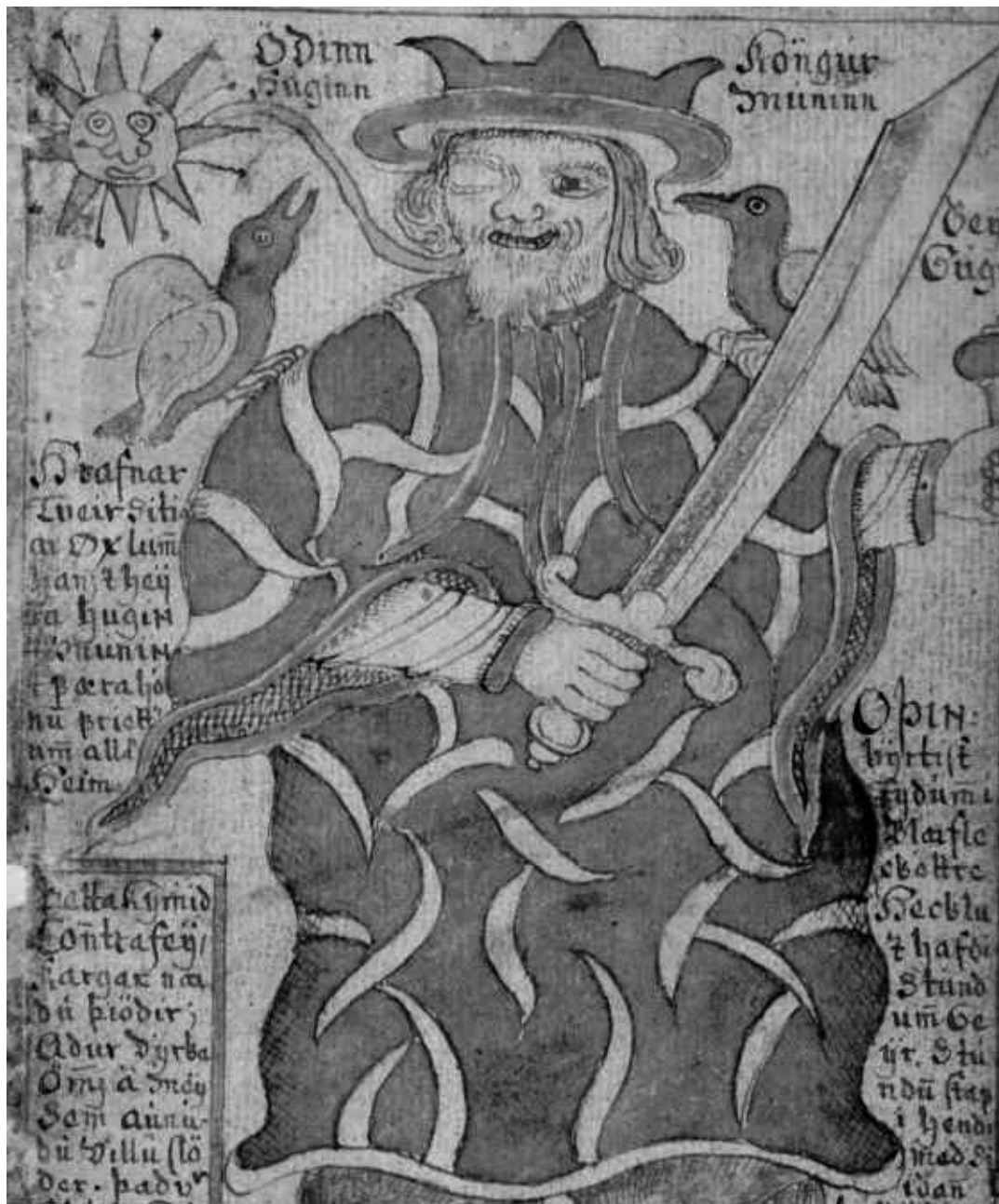
Odin, also known as Wotan, Woden, or Wodan, the king of the Viking gods.