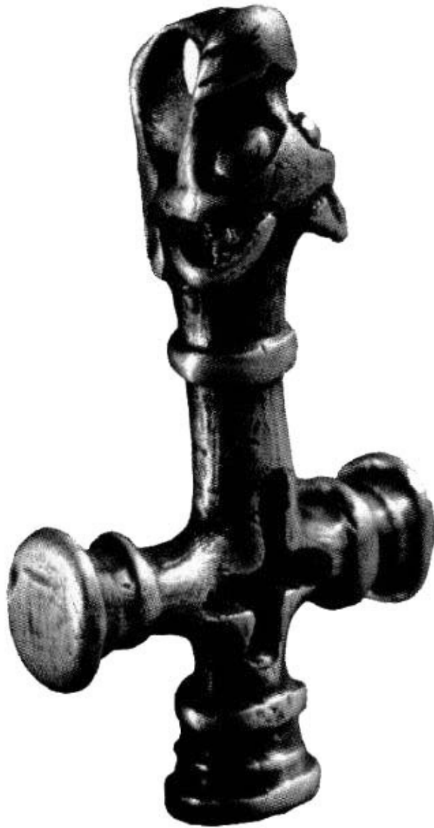
10-th century Viking pendant combines Thor's hammer with a Christian cross.