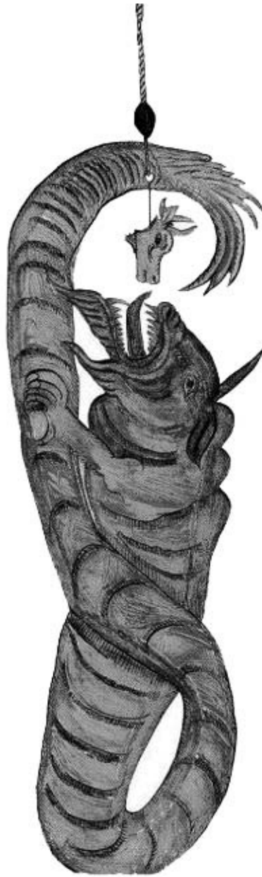
Evil World Serpent.

According to legend, Thor caught the evil World Serpent by baiting a hook with the head of an ox.