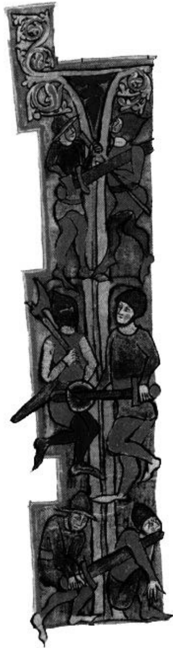
Viking warriors battle their eastern foes in territory that is now Russia, scene from an Icelandic saga.