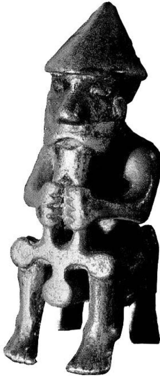
Thor, the god of storms, thunder and strength.