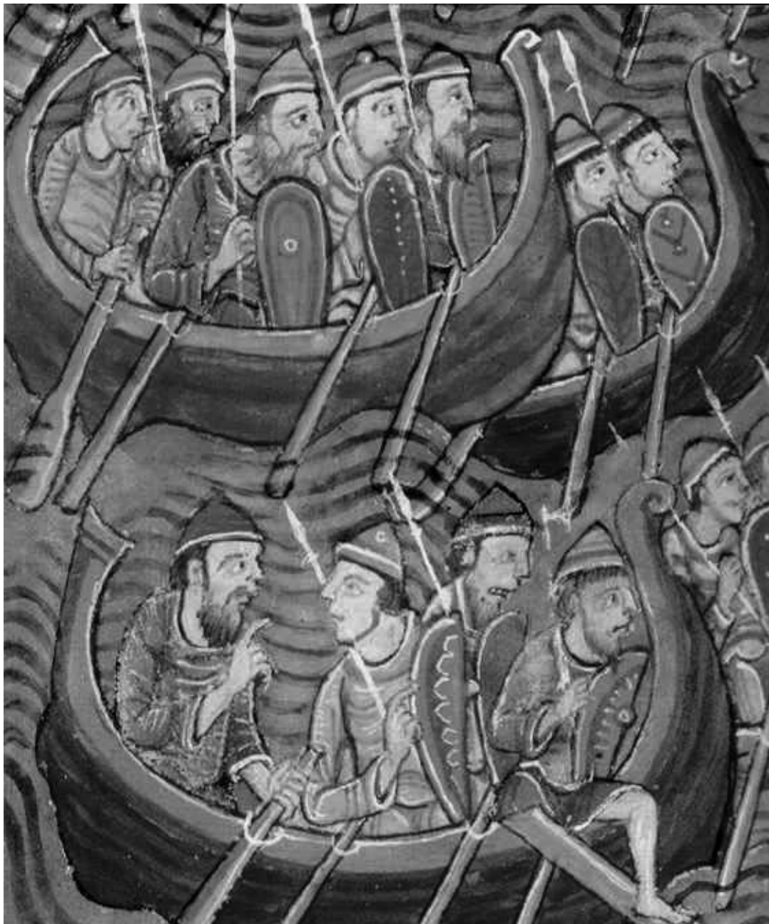
Well-armed Danish raiders approach the English coast in 866. From a 12-th century English manuscript.