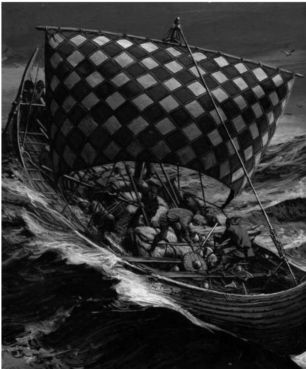
Viking merchant-plunderers ride out a storm at sea.