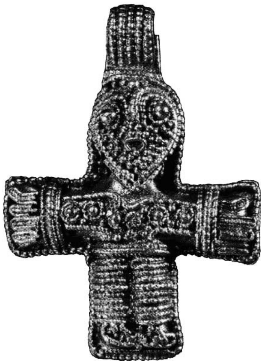
Silver crucifix, the oldest known Viking image of Christ. Found in a 10-the century grave in Sweden.