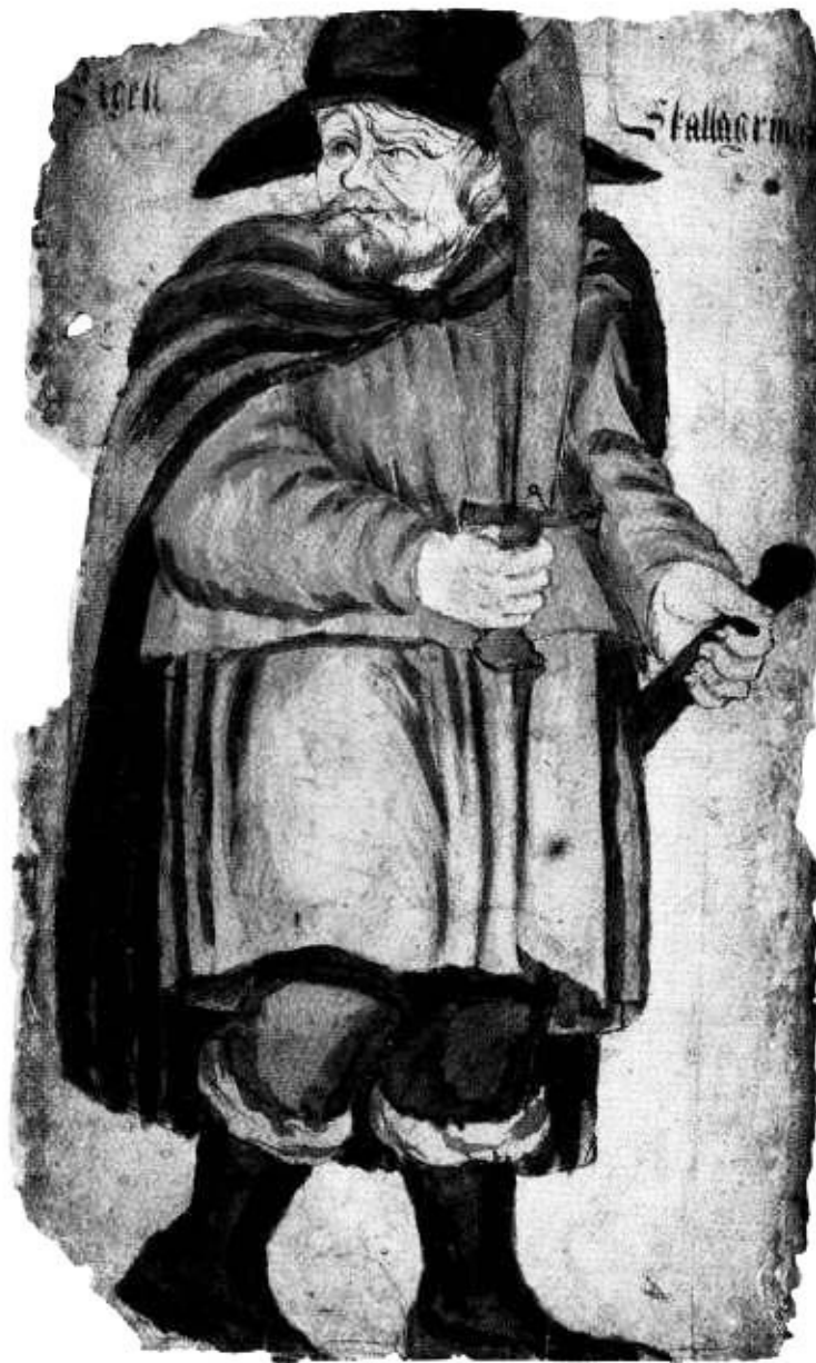
Egil Skallagrimsson, Snorri's ancestor, from a seventeenth-century manuscript.