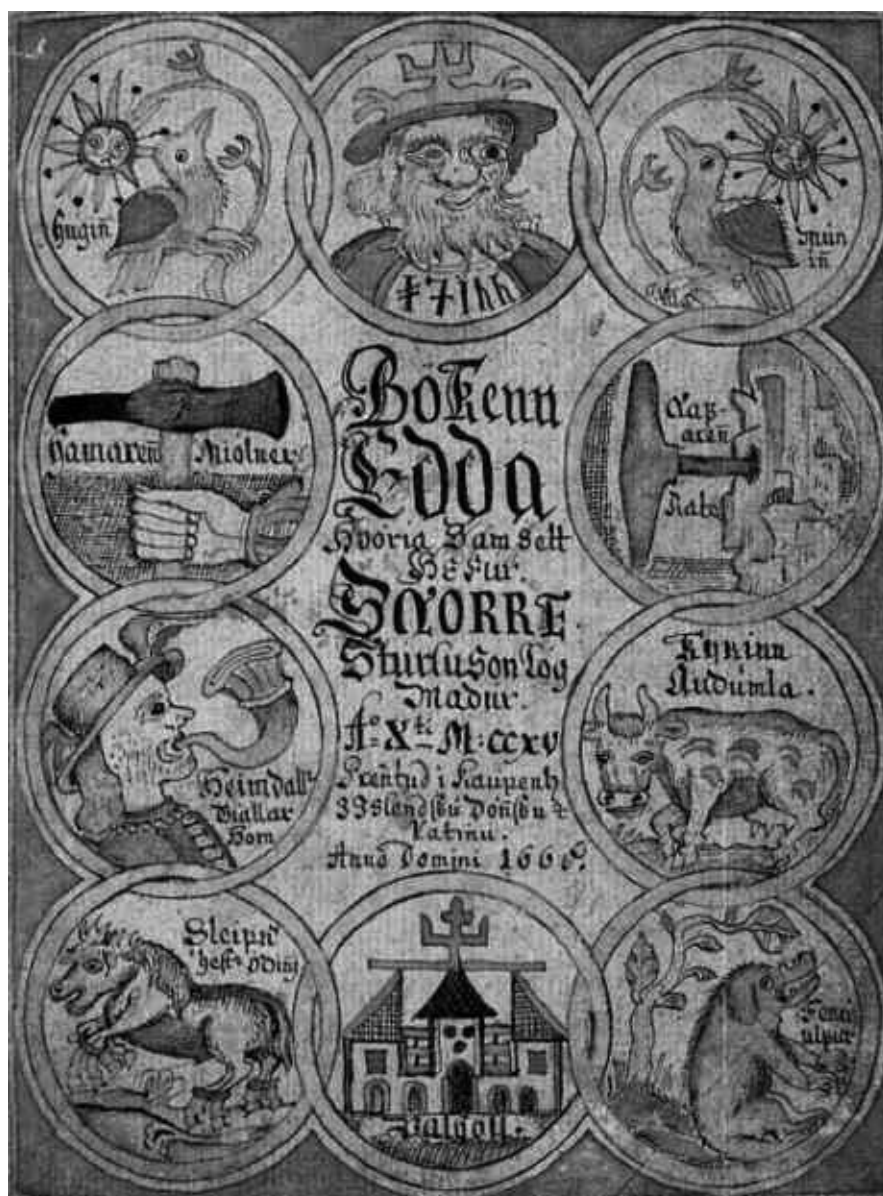
Print edition of Snorri's Edda of 1666.