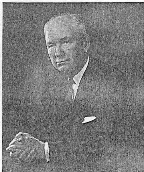
Robert Welch exposed as a devout supporter of International Zionism. The people he left in charge - even today - refuse to discuss International Zionsim.

. . . . Is it appropriate to flail Robert Welch after his death? Why don't we let it rest, since the Society is now under new administrators? . . . . It is important -- even at this late date -- to understand that the J.B.S. was founded and directed by those (with the exception of Revilo Oliver) who either did not comprehend the deeper workings of world conspiracies, or who deliberately hid the facts. Was Robert Welch totally ignorant of those deeper powers? It is difficult to imagine that he was, for three reasons: . . . . (1) His intellect was completely adequate; (2) he was well read; and (3) he had been exposed to the best truth tellers in the business.