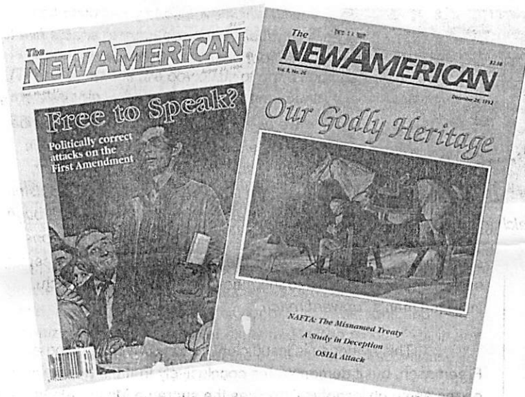
Deeply inspiring covers hide a "hands off Israel" policy of the John Birch Society.

. . . . In spite of this damning evidence, however, it appears that Robert Welch was simply naive. But that would not alter the final effect that The John Birch Society had on its members who were stridently anti-anti-Semitic. Thus the Society, without its members ever knowing it, has served the purpose of supporting Zionism and the political-religious state of "Israel." . . . In supporting Zionism, it has helped to preserve the life of the octopus know as socialism/Communism.