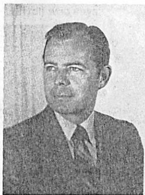
G. Edward Griffin