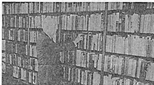
Robert Welch in his library!

.... This evidence is insufficient to convict him of being a Freemason, but it demonstrates conclusively that his world view ran on the same philosophical track as the supreme Mason Albert Pike and many others, including declared atheists. Thus, Robert Welch was indeed an enigma. (con't on next page)