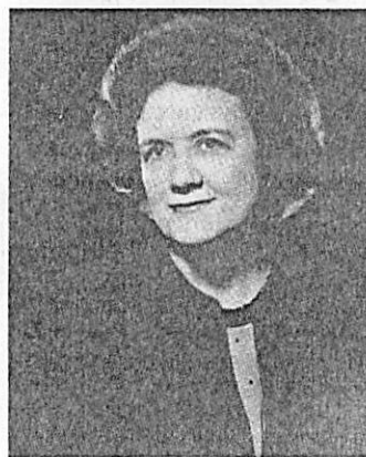
Elizabeth Dilling 1894 - 1966

A FAMOUS AUTHOR -- EXPOSED ROBERT WELCH -- IN THE 1960'S!