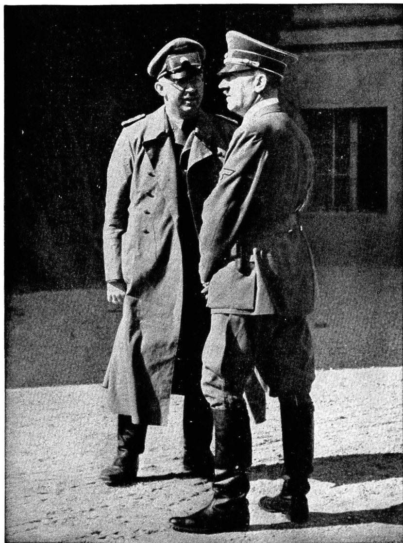
HITLER AND HIMMLER