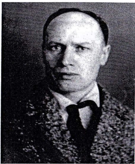
Arshinov in 1926