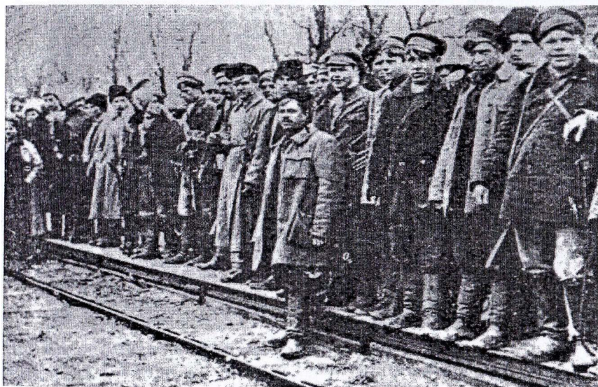
Group of Makhnovists