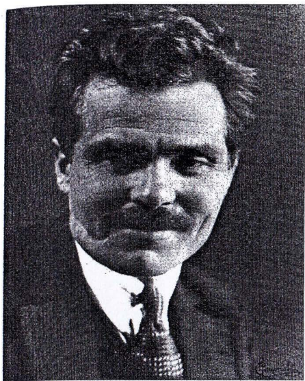
Makhno in 1930-31