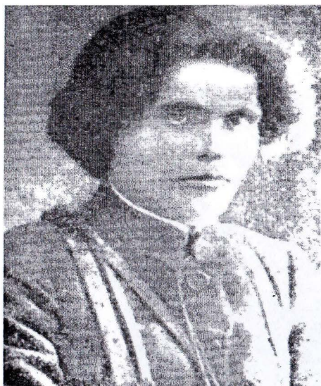
Makhno in 1918