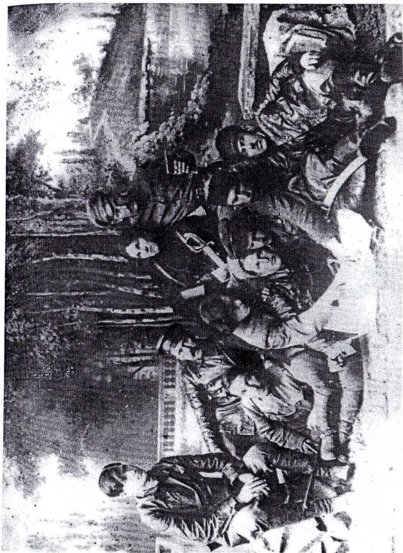
Staff of the Makhnovist movement in the spring of 1919.