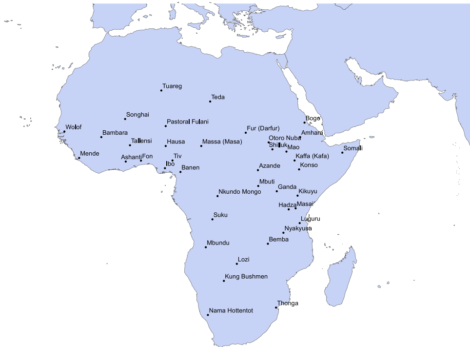
Fig. 2. African ethnic groups (sub-Sahara) in SCCS dataset.

political institutions took a different path historically creating qualitatively very different structures from those seen in Eurasia.