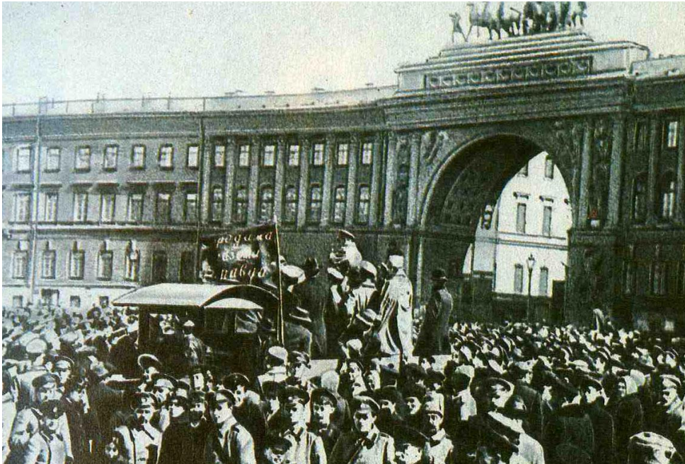
Bolsheviks speaking at a meeting of workers and soldiers in Petrograd in 1917