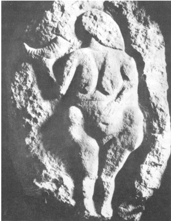
Paleolithic figurine of mother-goddess used in fertility rites (from Çatal Hüyük site, Turkey).