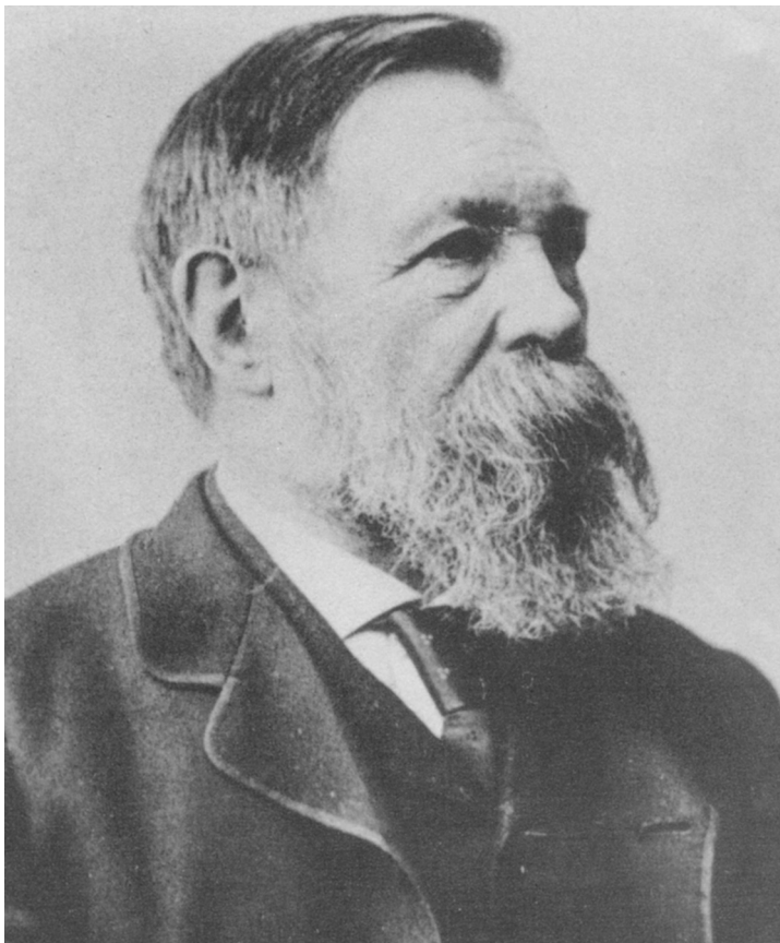
Frederick Engels in the 1870s.