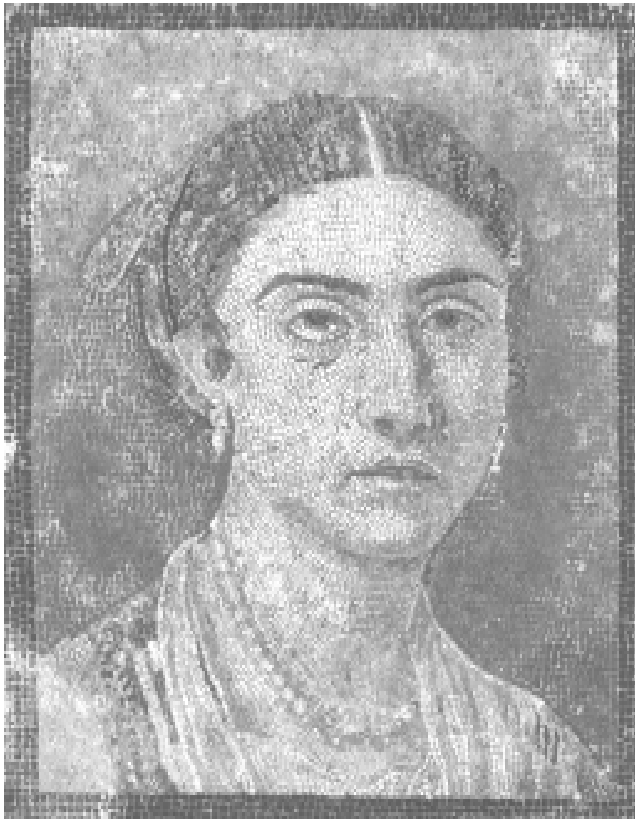
Pompei, mosaic portrait of a woman (late first century BC to early first century AD).