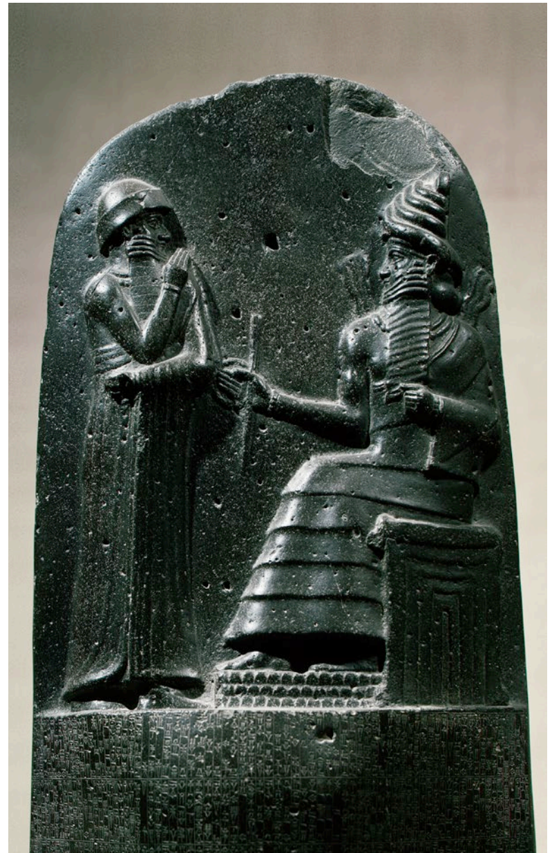
Hammurabi receives the laws from the Mesopotamian deity Shamash

Traditions from southern Mesopotamia also were adopted by Greek scholars. Especially in mathematics, ideas from Mesopotamia persist. Our day is still divided into 24 hours, each hour into 60 minutes, and each minute into 60 seconds. A circle still consists of 360 degrees. Cuneiform writing was used regionally until the beginning of the Common Era, when it disappeared.