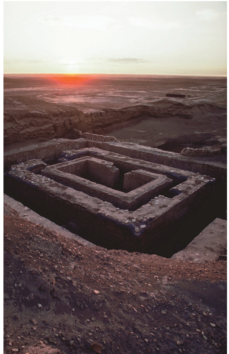
The ruins of Uruk

As people migrated into the two river valleys, they found that the soil produced abundant crops due to the fertility of topsoil from repeated flooding of