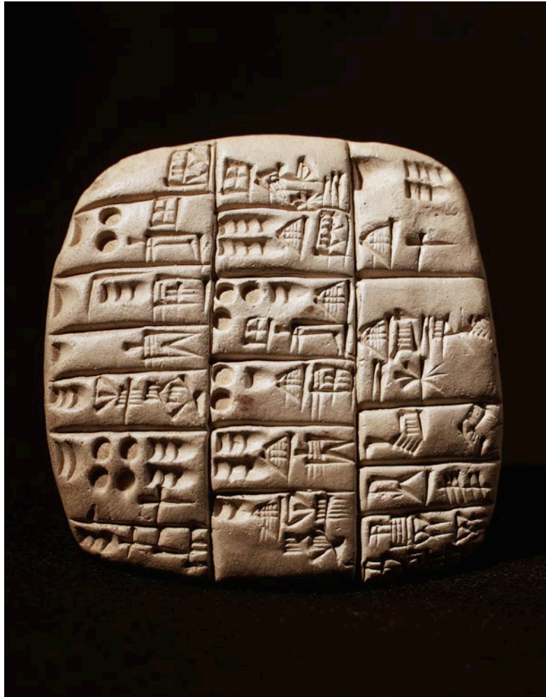
Cuneiform writing was produced by pressing reeds into wet, unhardened clay

the rivers. They could grow enough to store surplus grain, enough to support other individuals with occupations other than farming. The surplus grain needed to be collected and distributed; probably priests first managed this task. In addition to grains and domestic animals, people had plenty of fish and fowl from the river and marshes. Beer had already been invented, and a goddess of beer, named Ninkasi, was worshipped.